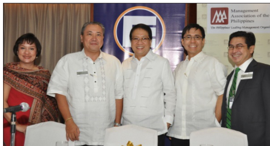
May 24, 2012 – Makati Shangri-La Manila Moving Towards a World Class Customs Administration