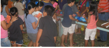
Donation Turnover to Brgy. Sampaguita Fire Victims June 2, 2012