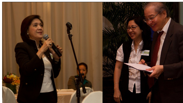
October 4, 2012, Peninsula Manila Economic Prospect for 2013