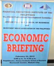
February 24, 2012 – Ateneo Graduate School Economic Briefing