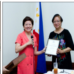
April 26, 2012 – InterContinental Manila, Phil. Labor Forum