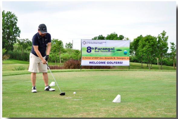
BSP Gov. Amando M. Tetangco Jr. during the FINEX 8 th Parangal Golf Tournament , June 30, 2012 at the Splendido Taal Golf and Country Club.