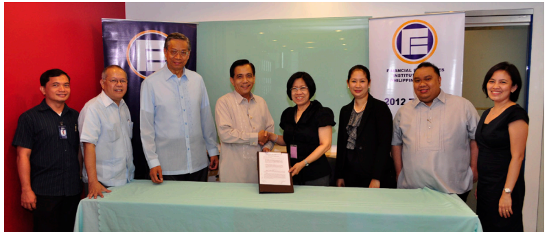
Grants & Fellowship and Research Committees MOU Signing with SEC June 5, 2012