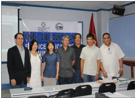
April 13–14, 2012 Southwestern University, Cebu City