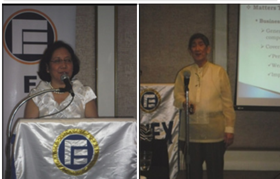
August 24, 2012, Dusit Thani Manila Managing Distressed Accounts and Legal and Extra Legal Remedies of Distressed Debtors