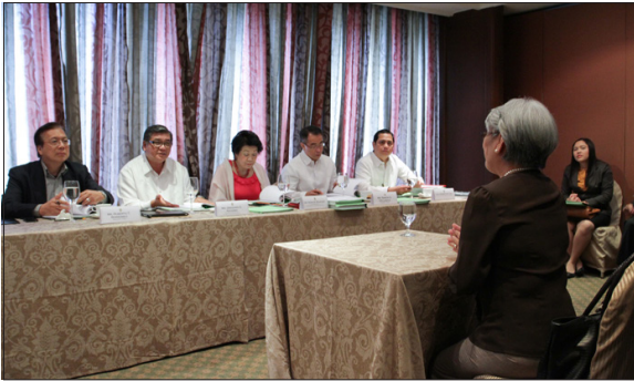
Final Interview and Judging InterContinental Hotel Manila, July 17, 2012