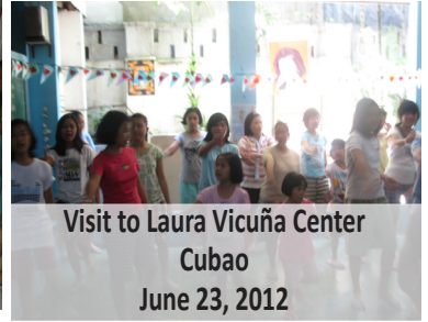
Visit to Laura Vicuña Center Cubao June 23, 2012