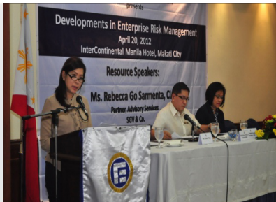
April 20, 2012– InterContinental Manila, Developments in Enterprise Risk Management