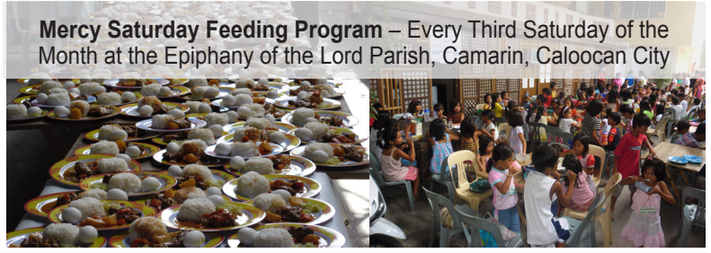
Mercy Saturday Feeding Program – Every Third Saturday of the Month at the Epiphany of the Lord Parish, Camarin, Caloocan City