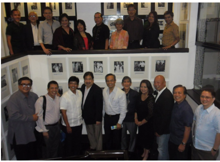
Welcome Dinner, Romulo Café, July 16, 2012