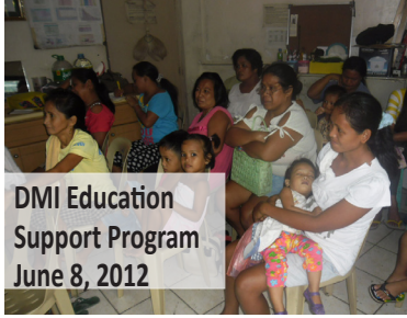
DMI Education Support Program June 8, 2012