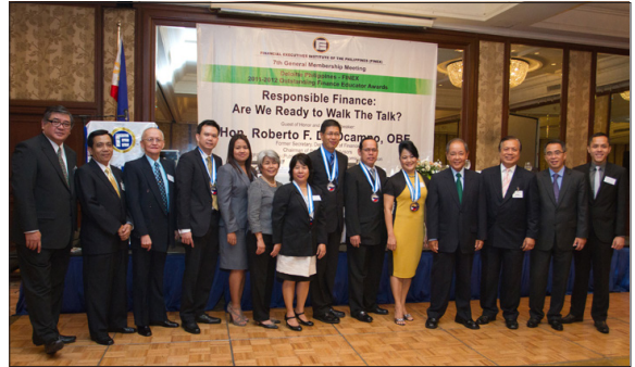
Awarding, InterContinental Hotel Manila, July 18, 2012