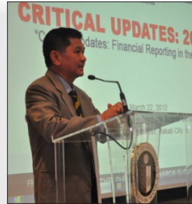
March 22, 2012 Ateneo Graduate School Critical Updates