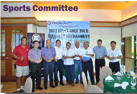
2012 FINEX Golf Tour Kick-Off Tournament, March 27, 2012, Ayala Greenfield Golf and Leisure Club.