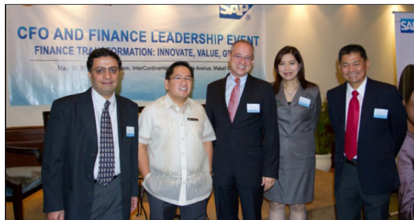
May 30, 2012 - InterContinental Manila CFO and Finance Leadership Event